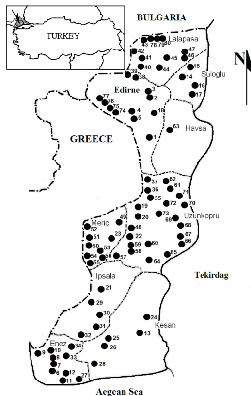
Fig. 1. Sampling localities in Edirne province and location of Meric-Ergene River Basin in Turkish Thrace.

laboratory using classical chemical and spectrophotometric methods [9].