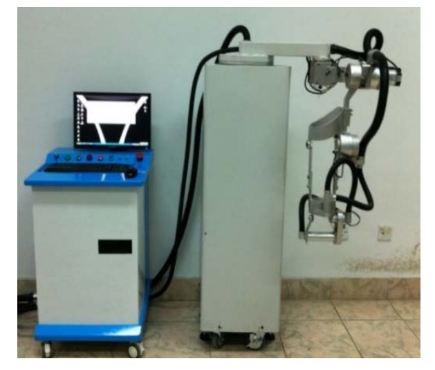
Fig. 1. Rehabilitation robot structure.

the training practices of different modes or different intensity. According to the evaluation results of the hemiplegic patients or their affected limbs, the rehabilitation training mode is selected for the following stage to remodel the brain functions and accelerate the rehabilitation.